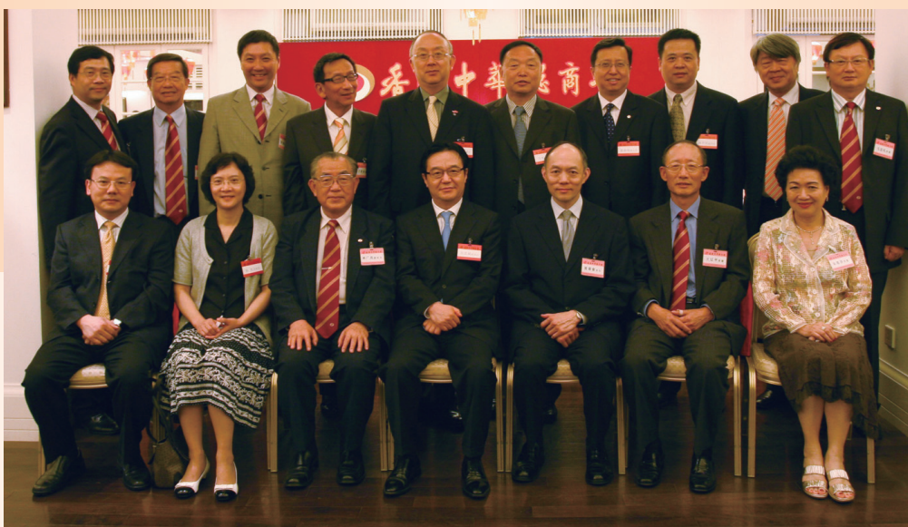
▲ 接待商務部副部長高虎城(前排中)。 Receiving Mr Gao Hucheng (middle, front row), Vice-minister of Commerce.