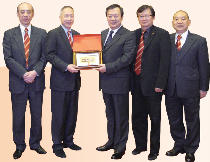
◀ 向浙江省省委副書記夏寶龍(中)致送紀念品。 Presenting a memento to Mr Xia Baolong (middle), Secretary of CPC Zhejiang Provincial Committee.