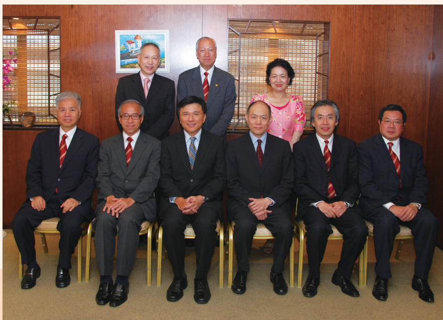
▲ 財經事務及庫務局局長陳家強（前排左三）到訪。 Receiving Prof K C Chan (third from left, front row), Secretary for Financial Services and the Treasury.