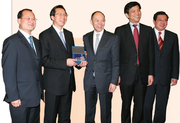
◀ 向吉林省省長韓長賦（左二）致送紀念品。 Presenting a memento to Mr Han Changfu (second from left), Governor of Jilin Province.