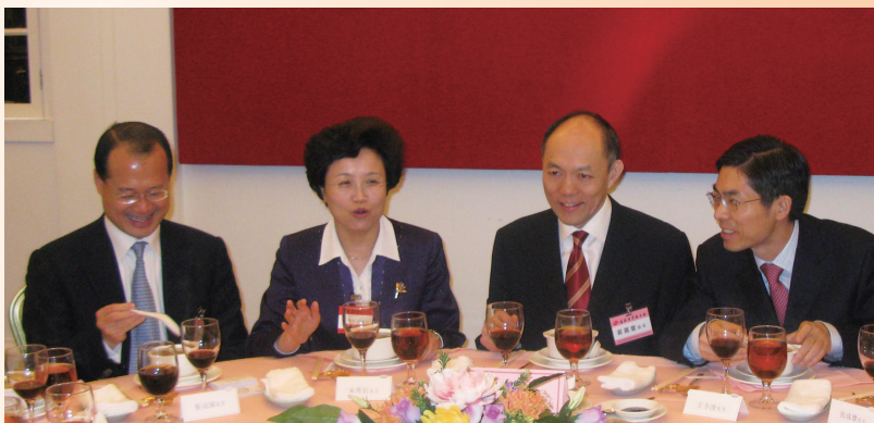
▶ 青海省省長宋秀岩（左二）與本會成員親切交談。 Ms Song Xiuyan (second from left), Vice-governor of Qinghai Province has a friendly chat with the Chamber's members.